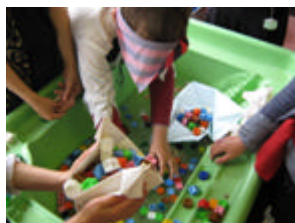
Problem Solving during our Pirate Day