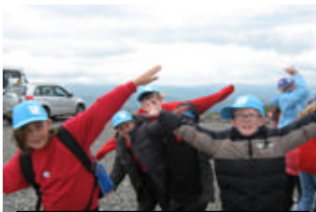
The Great Glen Energy Co-op Pr 5/6 feeling the wind