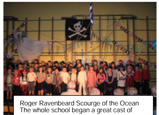
Roger Ravenbeard Scourge of the Ocean The whole school began a great cast of pirates.