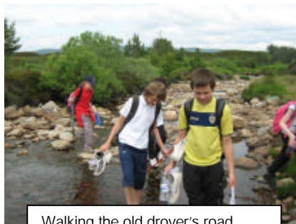
Walking the old drover's road, cooling off in the burn.