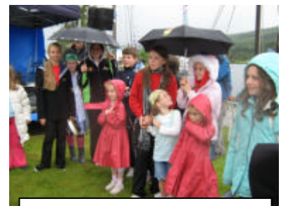
Braving the elements at the Crossing Event.