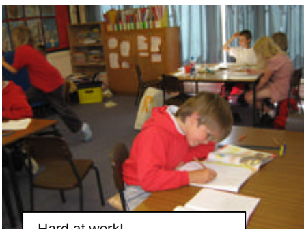
Hard at work!