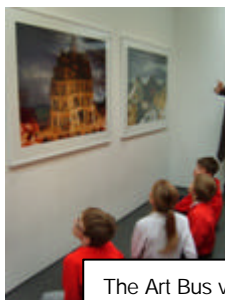
The Art Bus visits