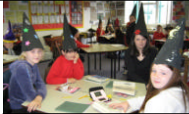
The Sponsored Spell