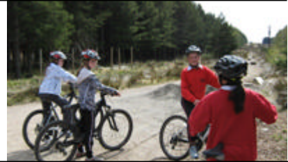
Pr 7 Girls on the Move at Abriachan Forest