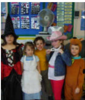
World Book Day Our favourite book characters