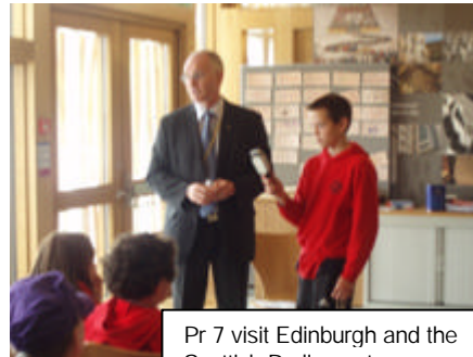
Pr 7 visit Edinburgh and the Scottish Parliament